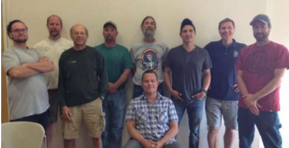
NWCCOG Weatherization Team

Some of the measures we take are: installing storm windows, fixing broken windows, increasing insulation in walls and attics, fixing furnaces, and replacing high energy refrigerators with more energy efficient models.